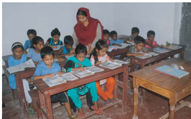
Harijan children of the schools are seen in the picture.

It may be mentioned that Harijans are most neglected and considered untouchable people in society. Harijans are also called dalits as they have traditionally occupied the lowest place in the caste system of Hindu religion. They are deprived of all kinds of basic rights. The number of their population is not known. But they are believed to be of thousands scattered across the country. ##