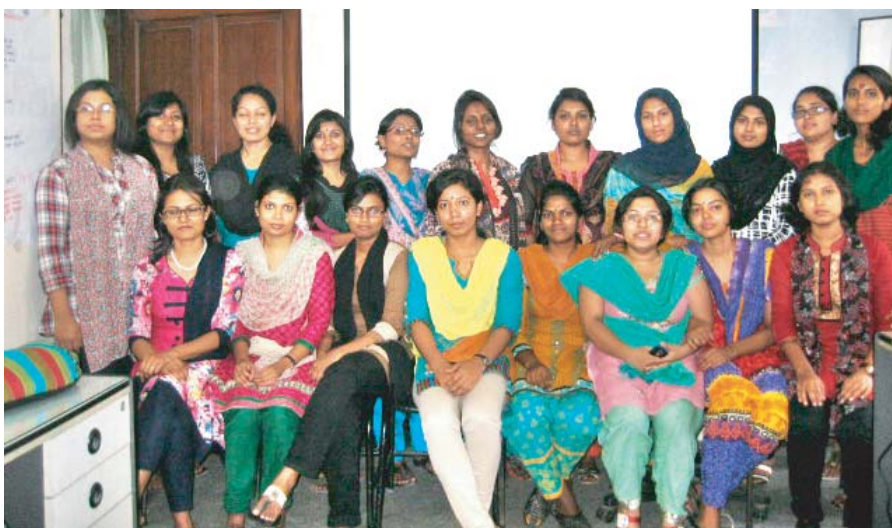
A group photo of fellows completed six months fellowship on Journalism, supported by the American Center

Since 1998 News Network has been encouraging young women to choose journalism as their profession. From 1998 to 2013 different donors, international organizations and missions provided support to continue the initiative. Main objective of the activity is to increase the number of female journalists in Bangladesh. This was done as women journalists are heavily outnumbered by males in Bangladesh. Women account for only 5 percent of total journalists in the country.