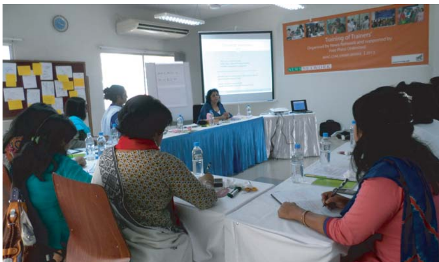
Photo of a session of 5 days ToT programme for women journalists.