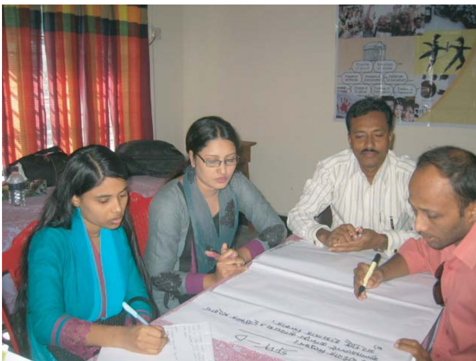
Journalist participants are completing their group work.

In last couples of years a number of journalists were killed and hundreds of them were attacked and injured, some of them seriously by miscreants and vested quarters in Bangladesh. Many received threats on their life. Such professional risks have increased in recent months. Therefore, Bangladesh is considered by international media rights groups as a dangerous place to work for journalists. Alarmed by the situation News Network requested TFD for funding a programme on professional safety of journalists. TFD responded positively and released grant to organize a workshop on the issues. The programme was completed very successfully.