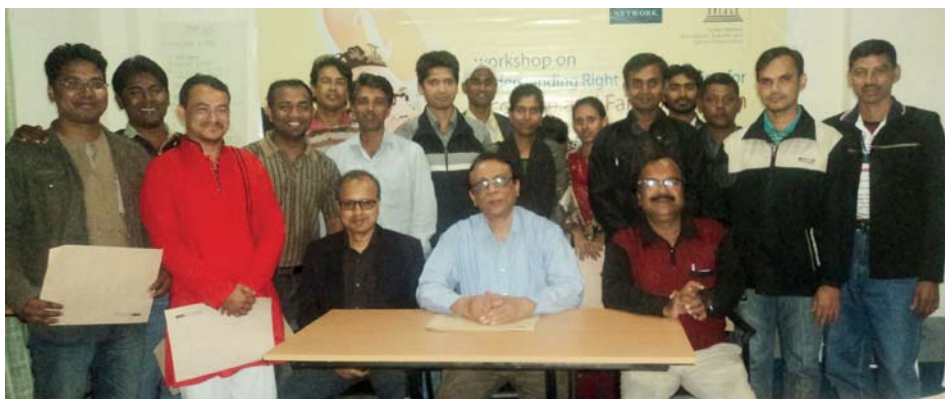
Group photo of the Journalists participated in a workshop on understanding right to information was held in Khulna city

Major part of the above mentioned programme has been completed successfully. With the assistance from UNESCO, New Delhi the plan has been to organise five workshops in five divisional headquarters. The districts are: Sylhet, Rajshahi, Khulna, Barisal and Chittagong.