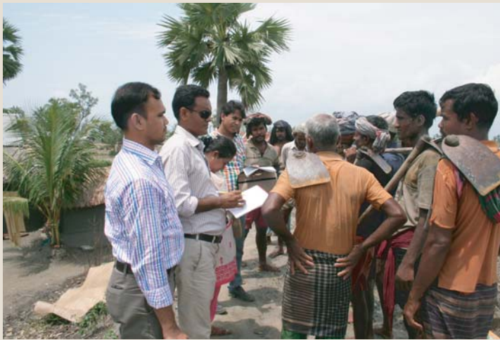
Participant journalists of regional training workshop on climate change issues are visiting in Aila affected areas near Sundarban.

Output of the programme was well appreciated. All the participants published/broadcast several reports for their respective local and national media houses.