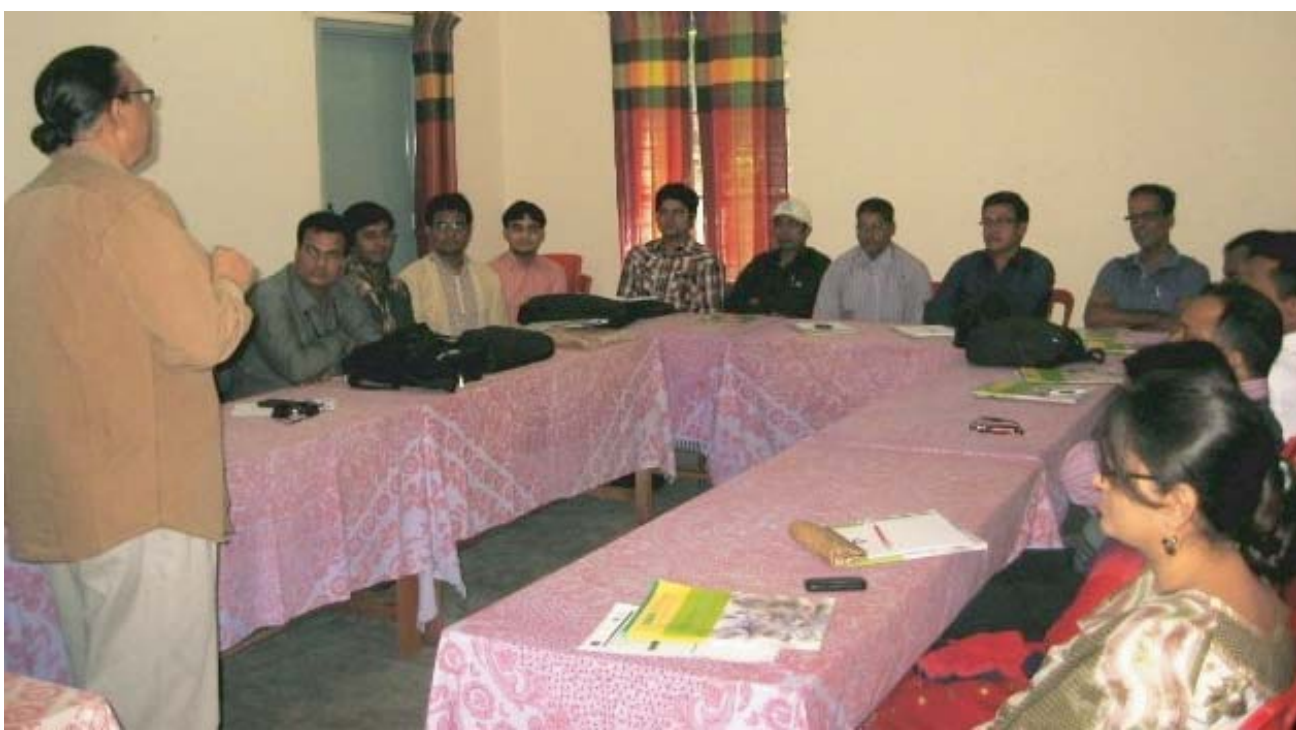
A session of a workshop on professional safety journalists

Participants found the workshop effective and interesting for understanding their professional safety. News Network will keep continuing the initiative.