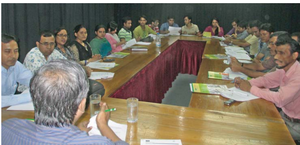
A session of a two day work shop on understanding right to information held in Chittagong city

It may be mentioned that the RTI Act was passed five years ago. Journalists are still found reluctant to use the law as a weapon for better reporting. There is also a lack of awareness about the law among the common people. Even the progress in implementing the law from top to grassroots level is not well appreciated.