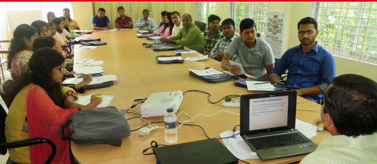
Journalist in Dinajpur are participating in a training session on risk analysis and security planning.

officials, opinion leaders and members of CSOs in nationally, regionally and locally. The activities also included identifying the beneficiaries/defenders and organising them in profession-based groups/caucus of rural journalists, CSOs and religious leaders locally and nationally. Gaps were also assessed and challenges identified that are faced by rural