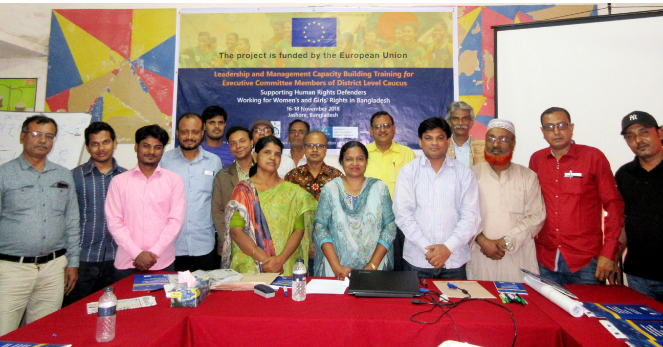
A group photo of DLC leaders.

Under the project activities, News Network has completed a four-month fellowship on human rights journalism for 20 young potential women in