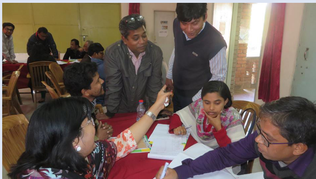
Participant journalists engaged in group work.

that the journalists were attacked while covering news on intolerance. To face such challenges, the project undertook several activities to sensitise them on the issues and strengthen the ability of journalists in project districts; Rangpur, Khulna and Jashore.