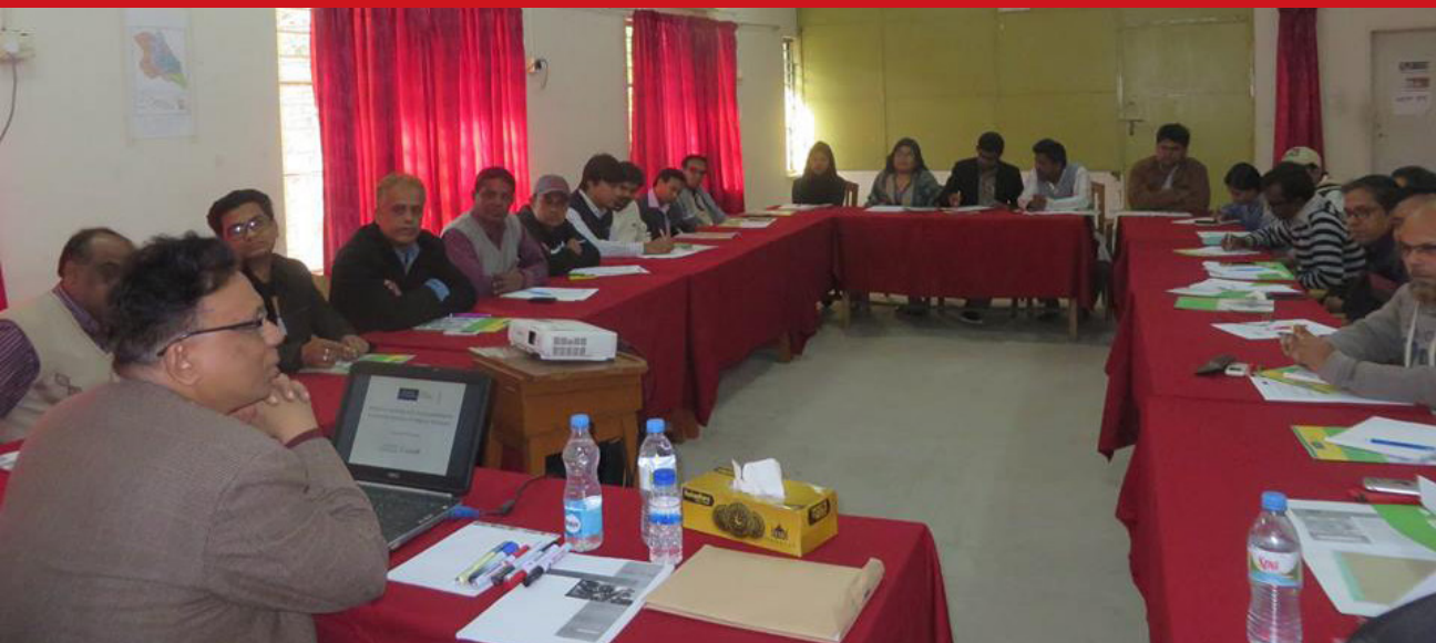
Participant journalists are in a training session on Religious Tolerance issues in Jashore.

that the journalists were attacked while covering news on intolerance. To face such challenges, the project undertook several activities to sensitise them on the issues and strengthen the ability of journalists in project districts; Rangpur, Khulna and Jashore.