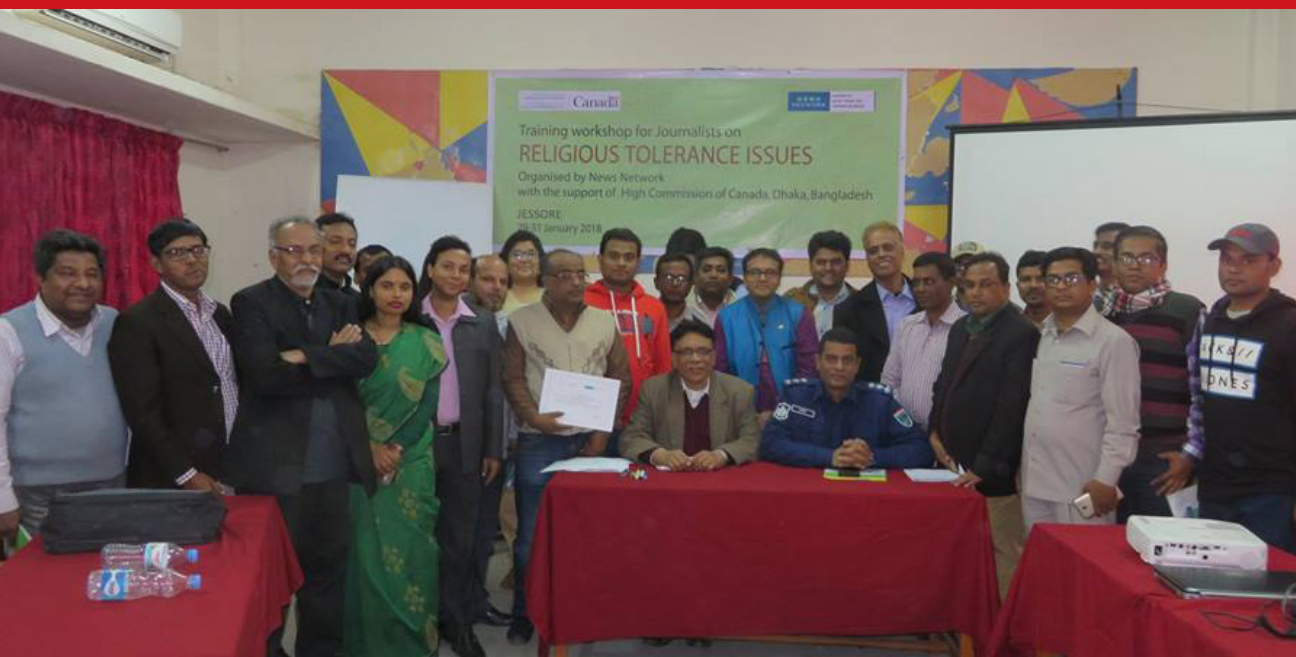
A group photo of participant journalists and guests of a training workshop on Religious Tolerance issues held on January 2018 in Jashore.