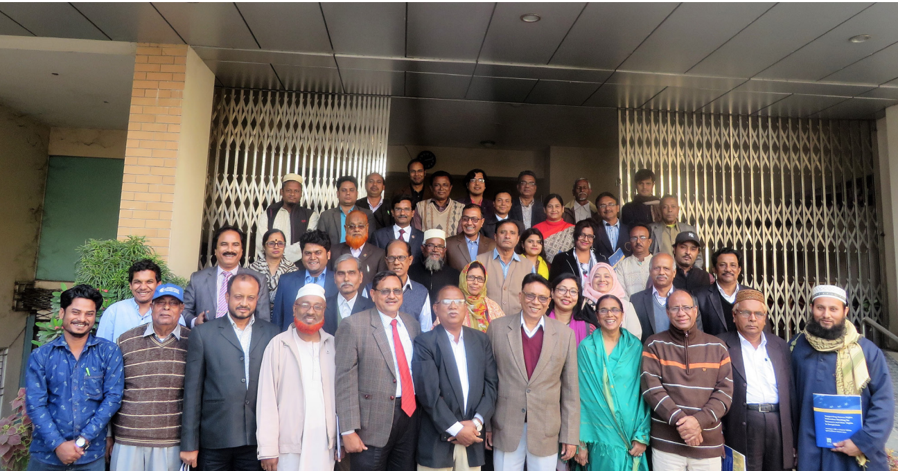
Leaders of Central Caucus / BHRDF.

Caucus members are highly active and they have become vocal in defending human rights. They are either participating or organising meetings, organising human chain and visiting the spot, where violence or violation of human rights occurred. One of their action was to meet the Deputy Commissioner (DC), government chief executive office and Superintendent of Police (SP), head of police in each project district before the parliamentary election held in December. They handed over memorandum and demanded to ensure rights of religious minority people and women so that they can cast their vote peacefully on the Election Day.