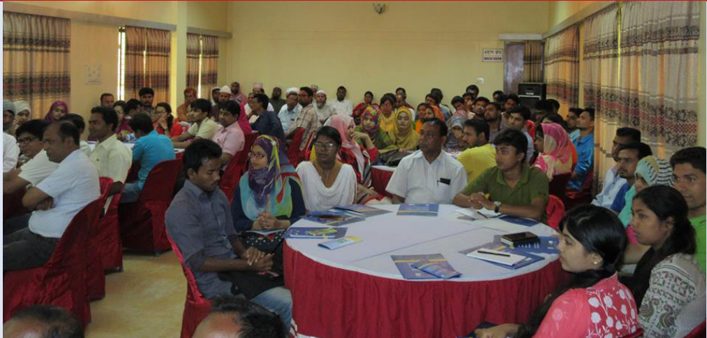
A scene of a regional level project startup workshop in Rajshahi city

and promote the role of WHRDs in the protection and promotion of human rights and fundamental freedoms and to protect them addressing the challenges, risks and threats that they may face and (ii) to support and protect defenders at risk due to their work for the promotion and protection of the full enjoyment of women's and girls' rights;