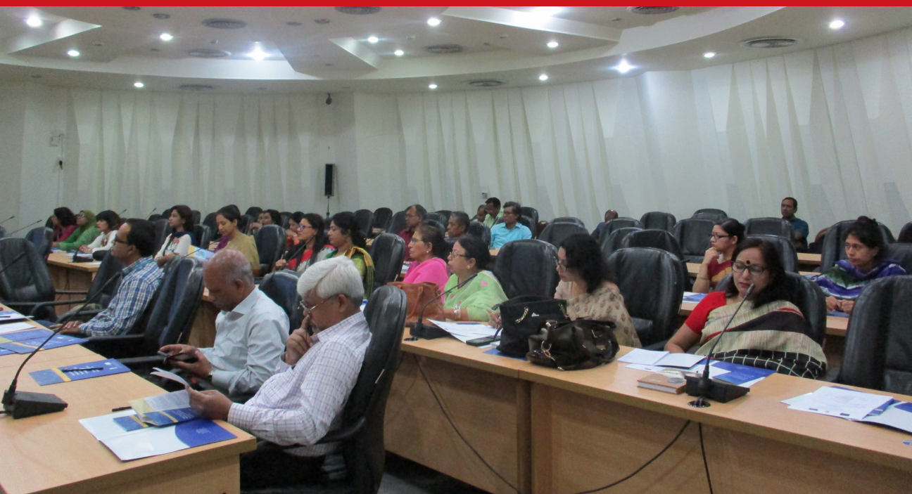
Delegates from various levels including government official, experts, CSOs, NGOs, youth, students and journalists are seen in project launching ceremony.

The beneficiaries are playing important role in the society but they are not well organised and lack necessary capacity to address the issues. In a recent assessment under the project, it was found that the rural defenders do not have enough and clear idea on human rights issues and protection mechanisms. Also, they do not have minimum knowledge