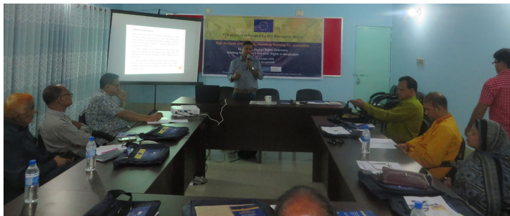
Local media gatekeepers based in Shatkhira are seen in an interaction meeting on risk analysis and security planning issues.

officials, opinion leaders and members of CSOs in nationally, regionally and locally. The activities also included identifying the beneficiaries/defenders and organising them in profession-based groups/caucus of rural journalists, CSOs and religious leaders locally and nationally. Gaps were also assessed and challenges identified that are faced by rural