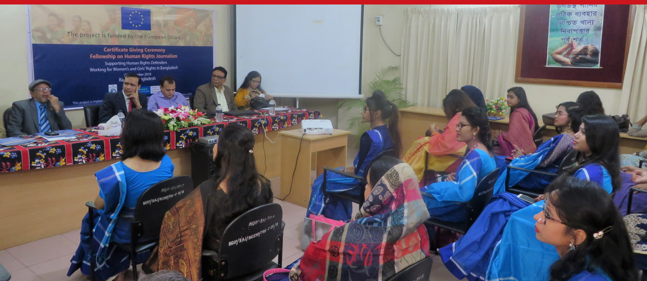
A view of the Certificate Giving Ceremony of the fellowship programme.

To achieve the objectives, several activities have been undertaken and different activities will be implemented in phases during the project period. In reporting period, activities were to give better understanding on the importance of project to relevant stakeholders, government