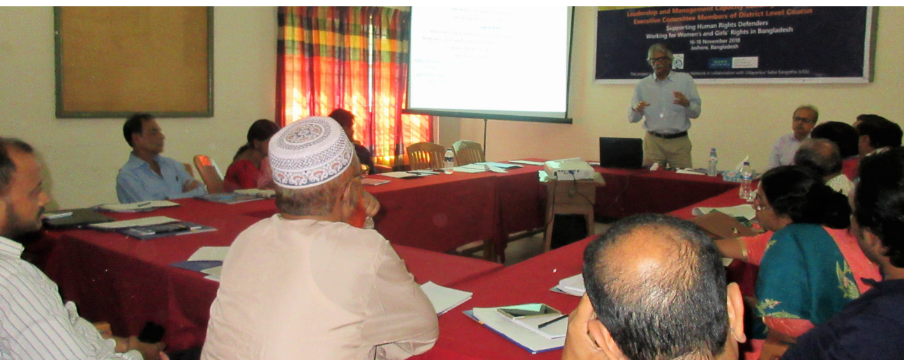
District Level Caucus (DLC) leaders are participating in a three-day Leadership and Management Capacity Building Training in Jashore.

defenders in protecting women and girls' rights. Activities also included organising the defenders and strengthening their capacity through sensitization and training workshops and offering fellowships to young potential women on human rights journalism.