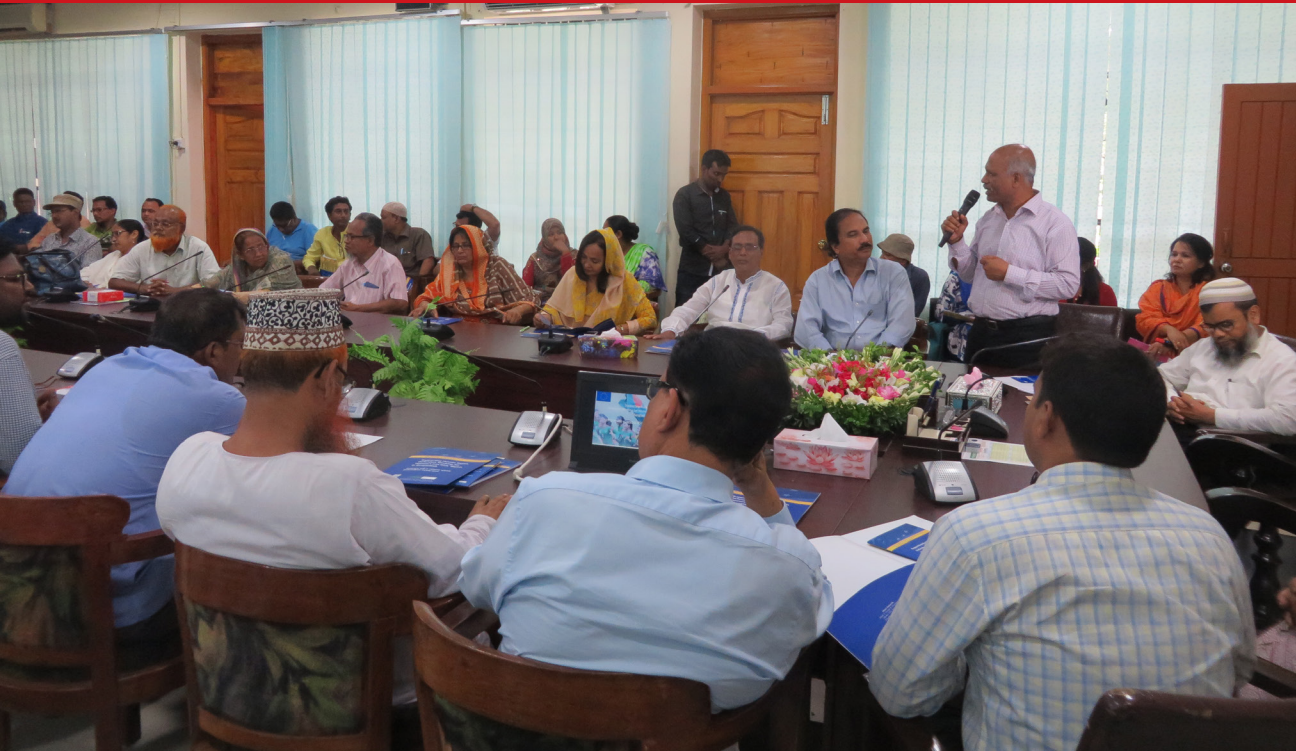
Participants from various sectors are seen in Kurigram district level workshop

on International Human Rights Organizations who work for Women's and girls' rights and beyond and no linkage with in-country and out-country human rights platform. Most of them never read Human Rights Declaration and Conventions. Considering all these, their capacity is considered as moderate sometimes and less than moderate mostly. as like - 30%. In very few areas, their achievement is termed as 'good' but they do not have more 40% achievement. On an average, more than 80% defenders do not have access to the documents as well knowledge they require.