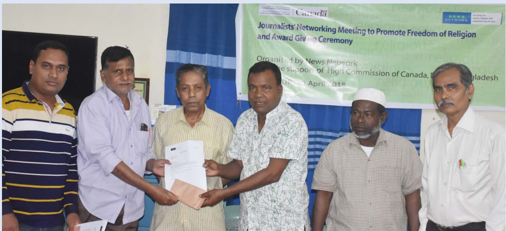
A group photo of the journalists based in Rangpur received awards for best reporting on religious issues.

A total of 74 reporters, working for local and national media and 28 local media gatekeepers were benefited from the project and were sensitised on freedom of religion. They also received skill development training.