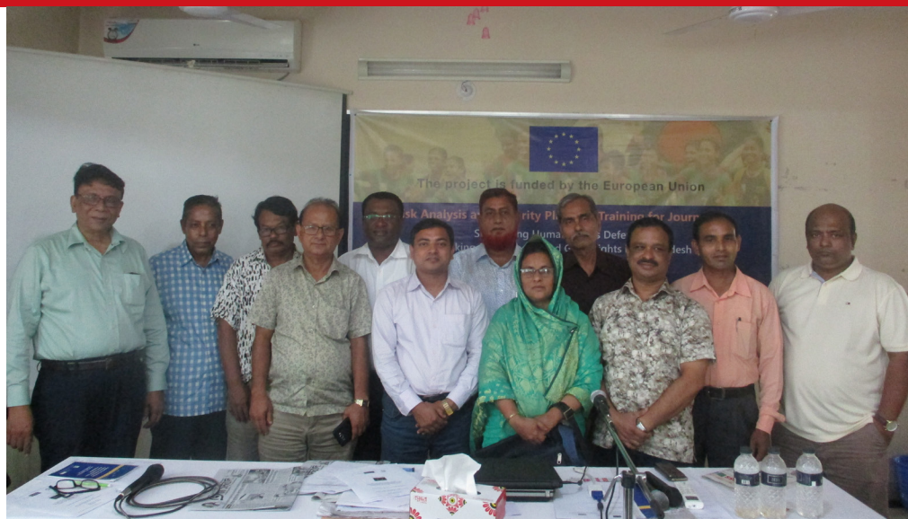
Group photo of local media gatekeepers, including editors, executive editors and news editors participated in a two-day interaction meeting in Rangpur on risk analysis and security planning.

defenders in protecting women and girls' rights. Activities also included organising the defenders and strengthening their capacity through sensitization and training workshops and offering fellowships to young potential women on human rights journalism.