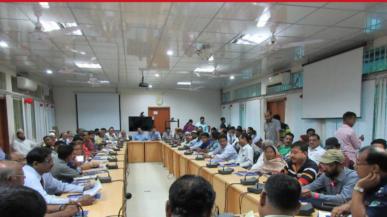
A photo of distric level project startup workshop in Satkhira