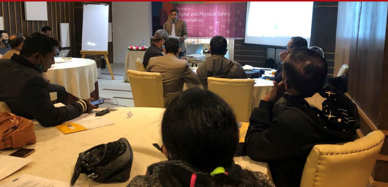
A snapshot of journalists training session held in Sylhet. About 25 Journalists participated in the three-day training (12-13 January, 2021) programme on digital and physical safety issues supported by Internews.