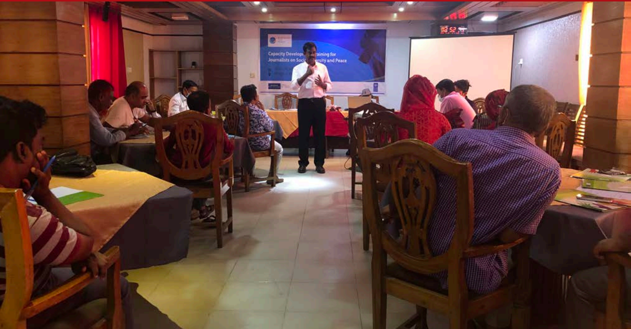
A group photo of Rangpur based journalists participated in a two-day (25-26 Sept, 2021) training workshop aimed at promoting tolerance, inclusive society, freedom of religion and diversity for peace