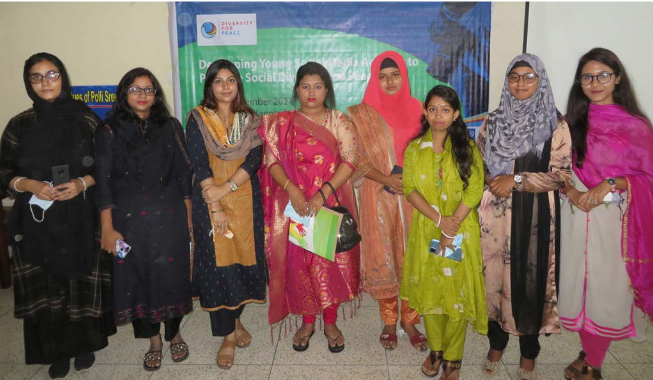
A group photo of young women social media activists participated in a Dinajpur training programme.

The project also awarded seven trained journalists for publishing in-depth reports on social diversity and religious freedom. A total of 80 journalists and social media activists were trained up under the project.