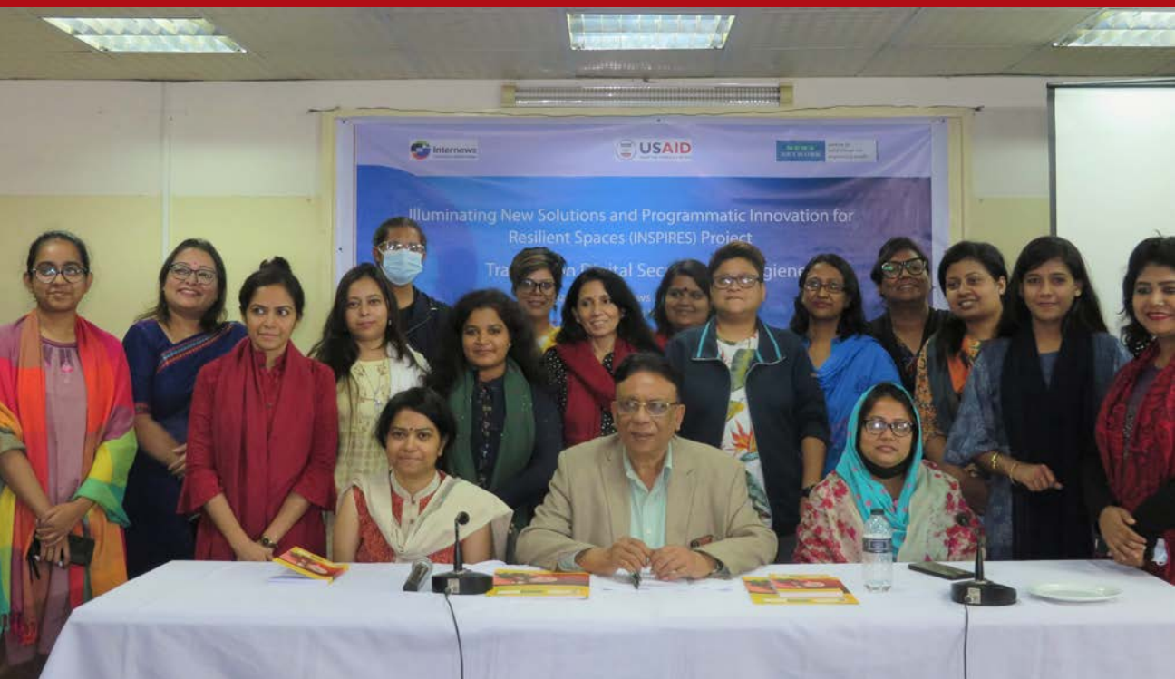
Group photo of female participants including journalists and human rights defenders who took part in a training programme.