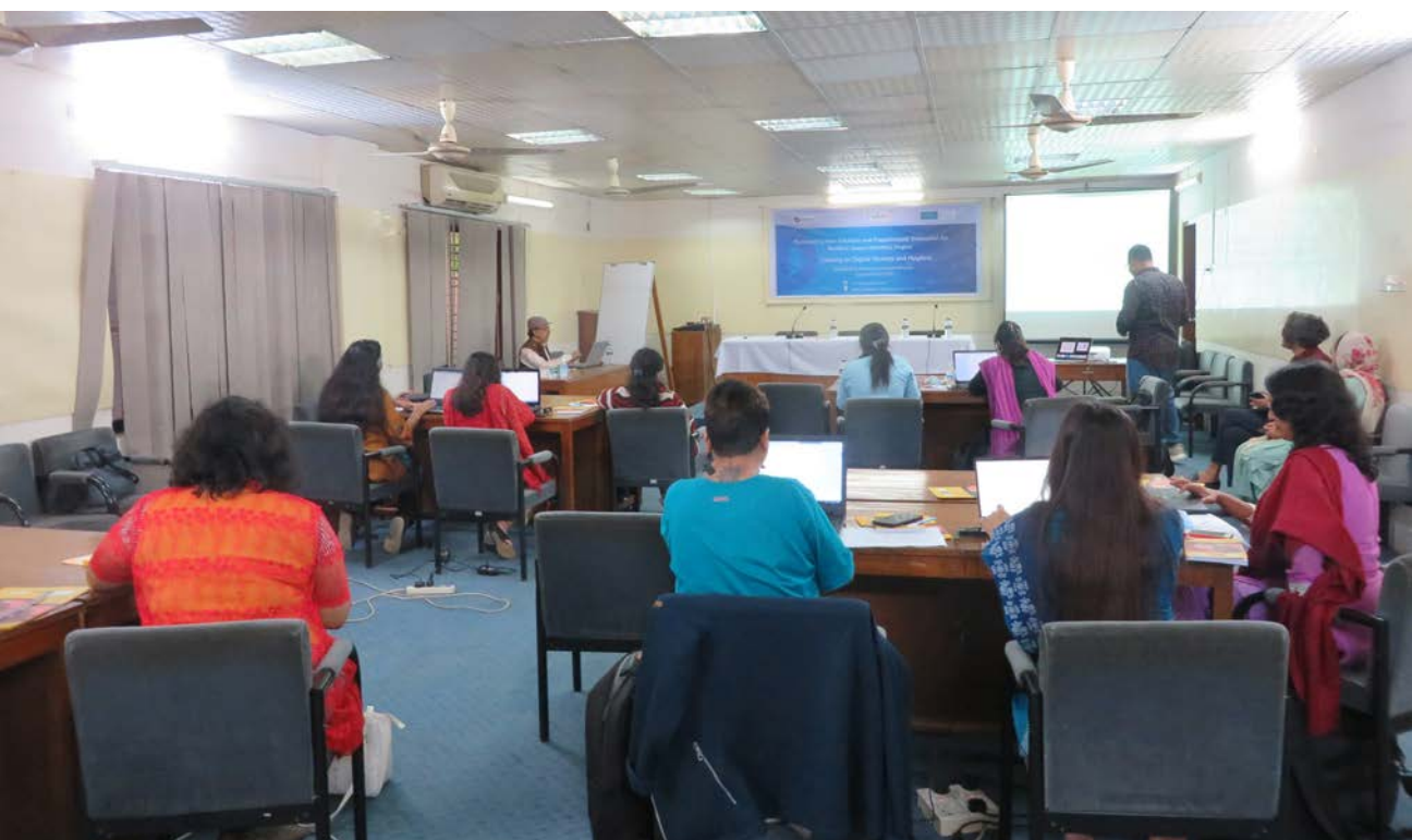
Snapshot of a female journalist training programme on “digital security and hygiene” held at Dhaka from 11 to 12 December, 2021. About 20 female journalists and human rights defenders based in Dhaka participated in the training, supported by Internews.