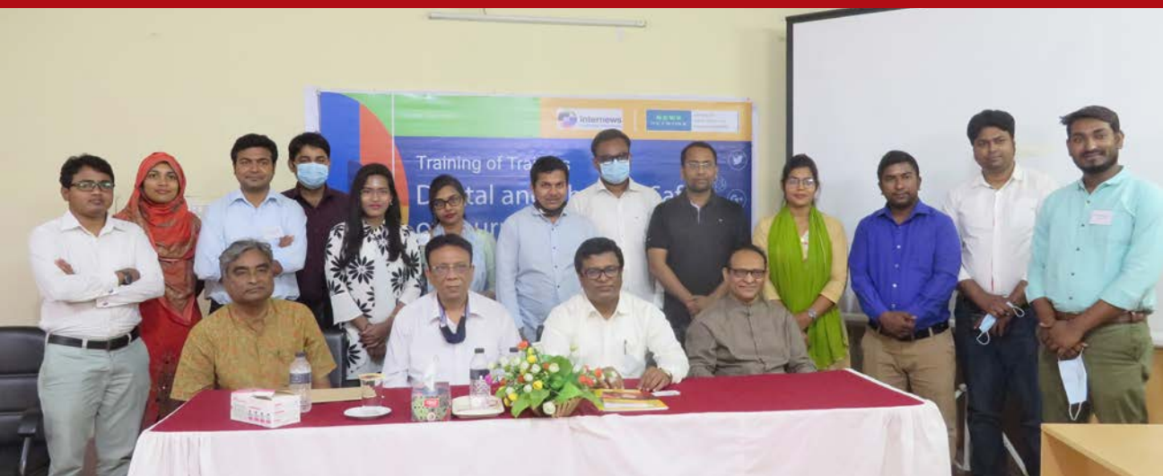
A group photo of a ToT (training of trainers) participants on digital and physical safety. The training was organised at Rajshahi divisional headquarters from 22-24 March, 2021 with financial support from Internews.