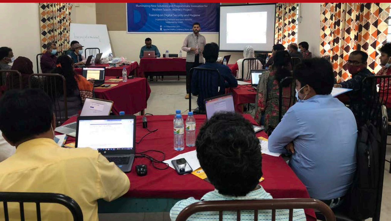
A scene of media training programme on digital safety and security organised at Jashore district town from 13 -14 November, 2021