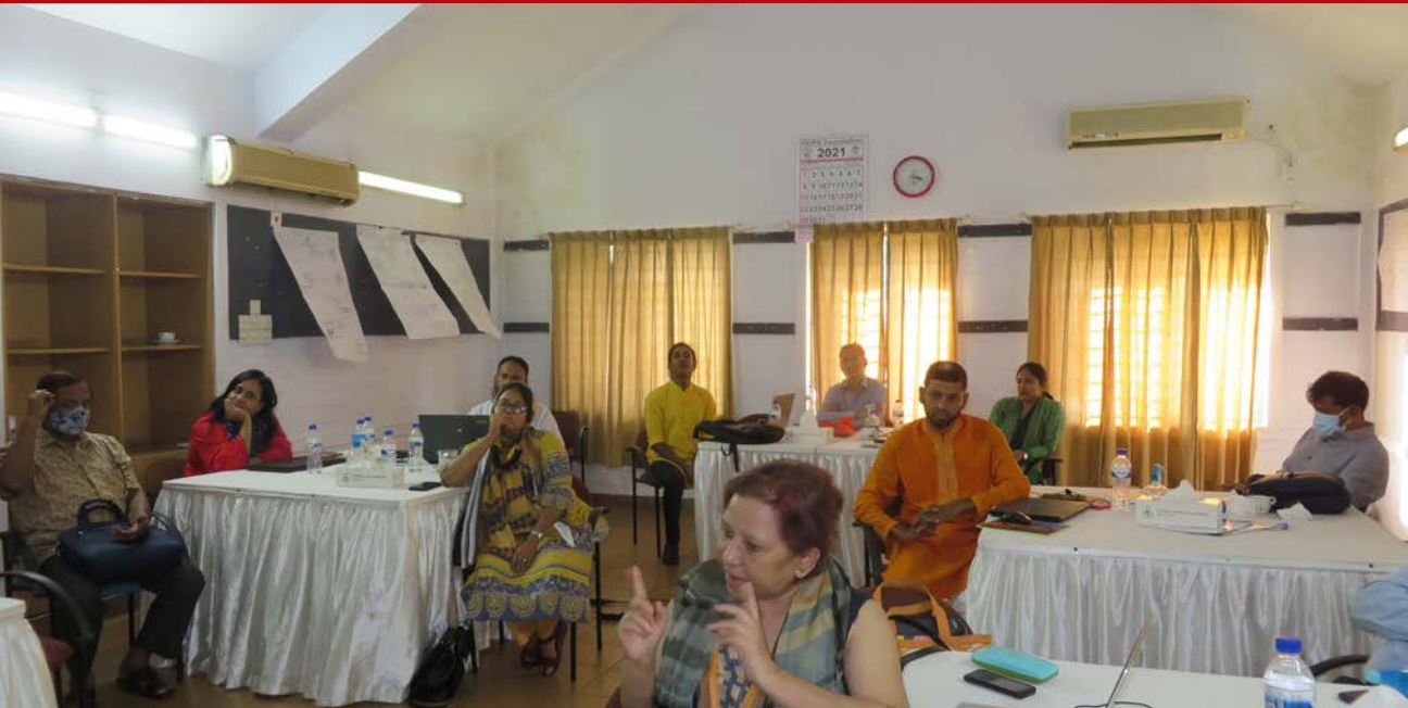
A photograph of a ToT programme on digital security and hygiene held in Dhaka from 27-29 October, 2021 supported by Internews.