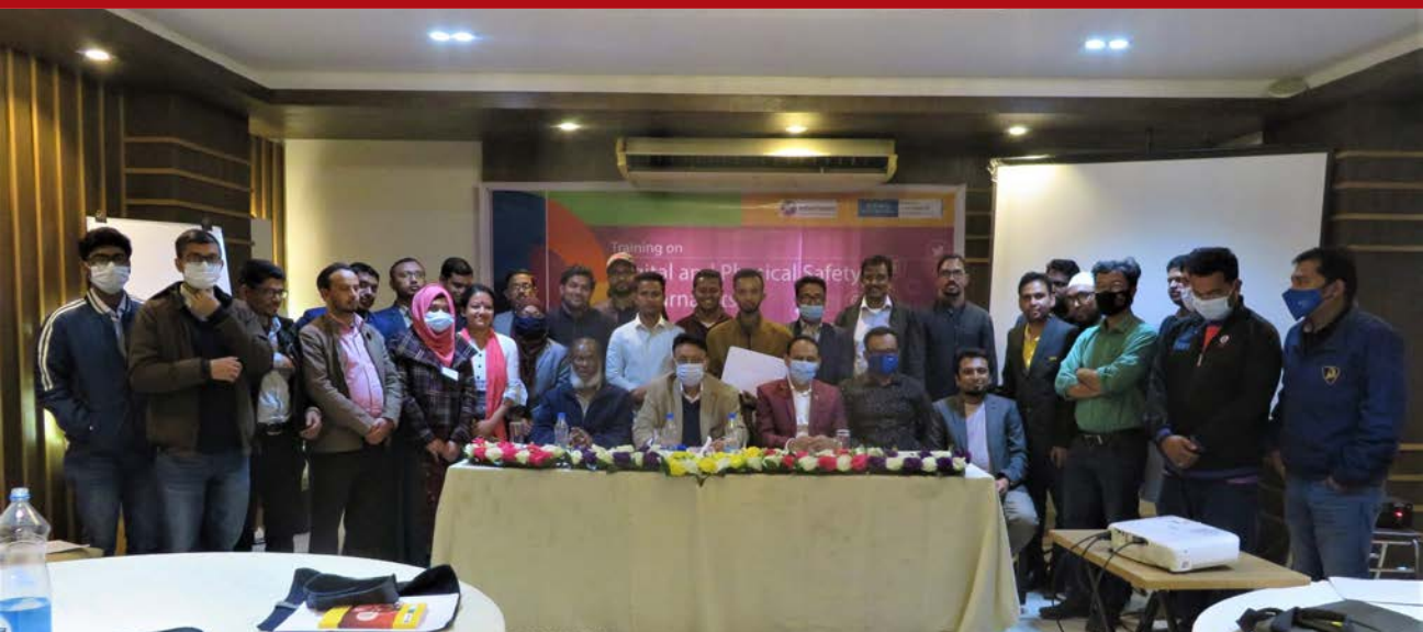
A snapshot of a capacity building training for media people on digital and physical safety held at Sylhet divisional headquarters from 12-13 January 2021. The programme was supported by Internews.