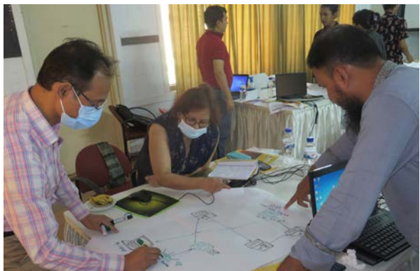
ToT participants exercising group works for presentation. About 12 media people and human rights defenders received the training.

NewsNetwork has successfully completed a six and half month long (16 June 2021- 31December 2021) project with the support of internews. The project was aimed to increase the digital knowledge of journalists and human rights defenders which will help them work safely in an increasingly restricted digital environment.