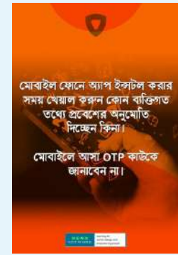
Posters for internet users' security was develop under the project

Some major activities of the project included conducting a research, capacity development of the beneficiaries and publishing articles, developing blogs and posters on digital rights issues to make people more aware about the subject and inspire them to come forward to protect and promote internet freedom. The project was implemented successfully and ended in April 2023.