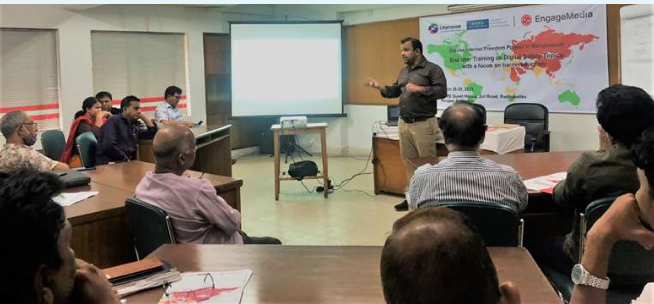
A snapshot of a training-workshop held in Rajshahi on promoting internet freedom and understanding digital security issues

Nowadays people are increasingly becoming victims to internet shutdown and blockage. Very often, governments shut down the internet access, control the speed, block websites or restrict internet services in an apparent attempt to stop spread of discontent, disinformation and sometimes to maintain law and order situation.