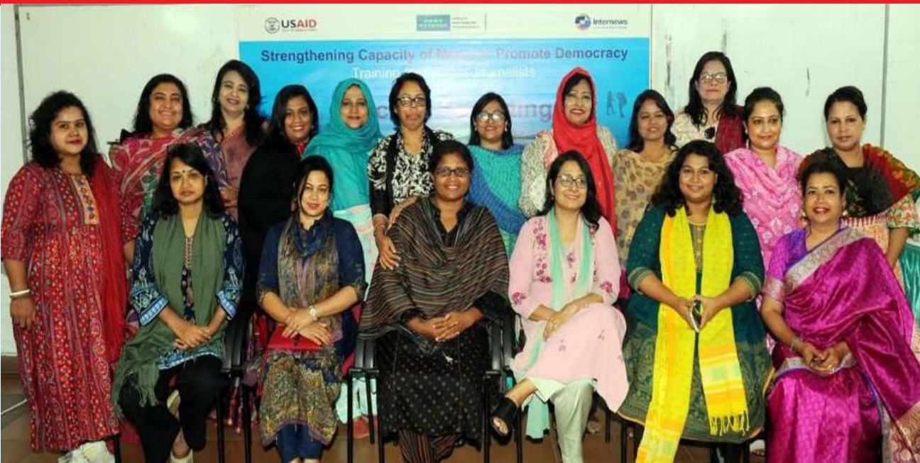
A group photo of Dhaka based women journalists participated in a capacity building training programme in 2023