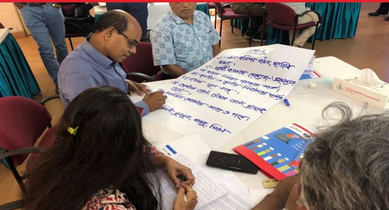
A group of journalists finding out the challenge of election reporting

To achieve the goals, activities were undertaken to improve the professional ability of national, regional, and local journalists across the country for maintaining highest ethical standard, accuracy, and objectivity to promote democracy and good governance in the country. Under the project some 20 training programmes were conducted in 16 divisions and districts across the country including the capital city Dhaka.