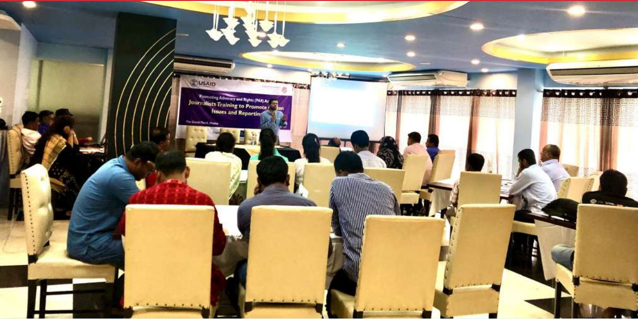
A snapshot of training session on election reporting